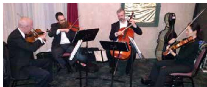
Beautiful music provided by an Erie Philharmonic String Quartet.