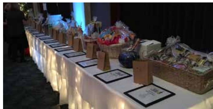
An impressive display of Raffle items!