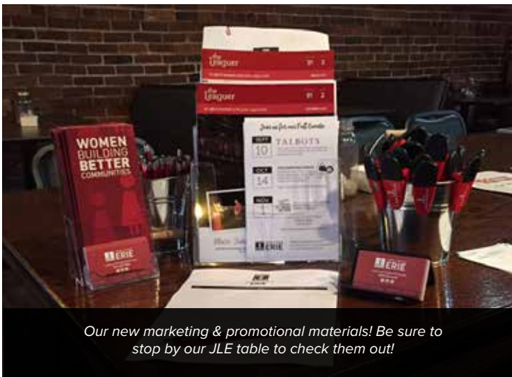
Our new marketing & promotional materials! Be sure to stop by our JLE table to check them out!