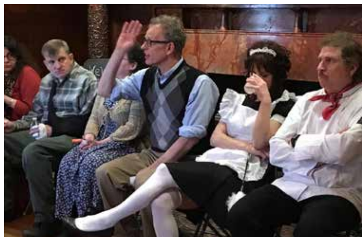
Motel Mayhem - A Murder Mystery Fundraiser at the Watson-Curtze Mansion on April 1, 2017.