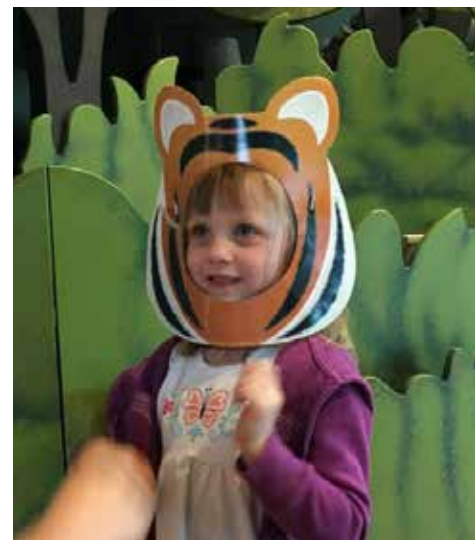
Future Junior Leaguers at our family-friendly social at TREC.